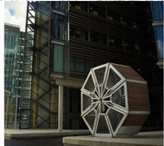
Heatherwick-Bridge (Foto: Heatherwick)